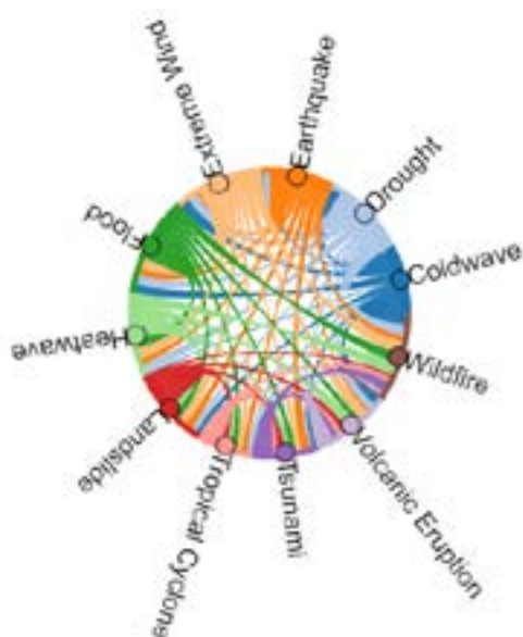
• Figure 2: Chord diagram showcasing different hazard combinations in the EU.

extent and timing) of single hazards (Claassen et al., 2023). We used MYRIAD-HESA to develop a first global dataset of multi-hazard event footprints based on earthquakes, volcanic eruptions, landslides, tropical cyclones, cold waves, heatwaves, extreme wind, tsunamis, floods, droughts, and wildfires. The chord diagram (Figure 2) shows the complexity of interlinkages between actual past hazard events within the EU.